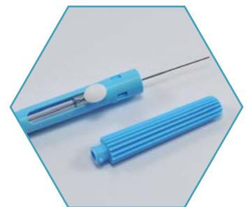
Removable proximal handle