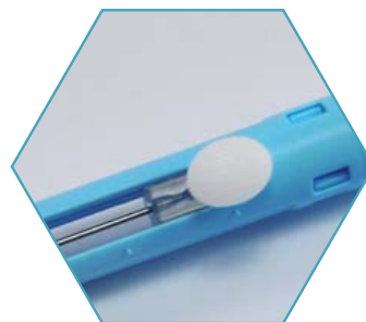
Break indicator for hook release