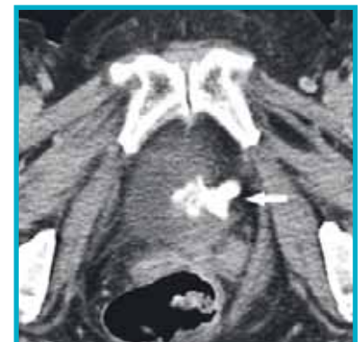
Axial CT Scan